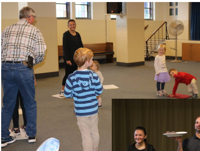
Pastor Appreciation Ice Cream Social and Cake Walk! October 14, 2018