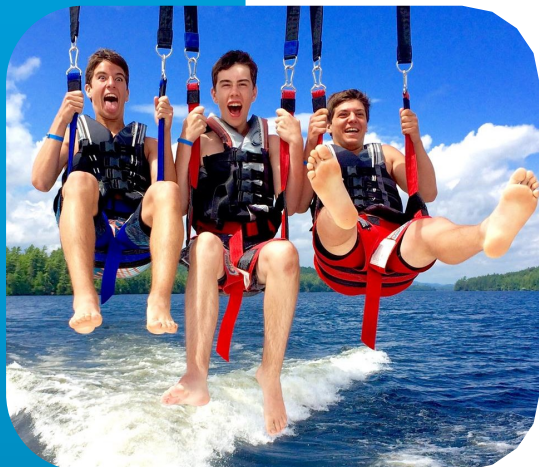
Ashland boys at camp.